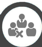
Skillful Screening Process