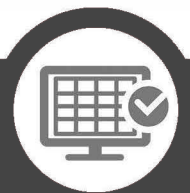
Monitoring and Oversight

For additional information, visit www.MinistrySafe.com , or call 817-737-SAFE (7233)